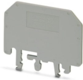
Partition plate, length: 60 mm, width: 2 mm, height: 48.9 mm, color: gray

Please be informed that the data shown in this PDF Document is generated from our Online Catalog. Please find the complete data in the user's documentation. Our General Terms of Use for Downloads are valid ( http://phoenixcontact.com/download )